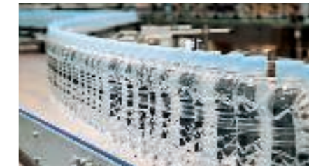
Drinking water & beverages

The analysis of drinking water and beverages typically involves reagent tests since they offer lower detection limits for parameters such as manganese and sulfate. Prove 300 is ideal here as it allows UV/Vis analyses, and is preprogrammed with free applications, like bromate and brewery tests.